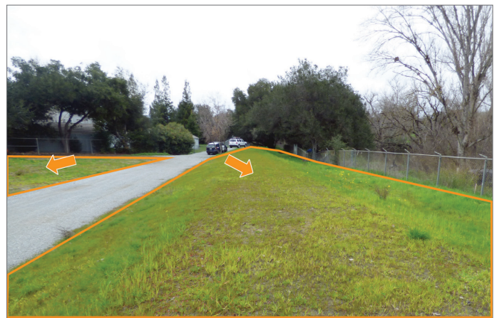
Rocksprings Temporary Berm

The mid-reach is owned by a combination of the City of San José and private landowners, and the upper reach between Tully Road and Anderson Dam is owned mostly by the County of Santa Clara and some private landowners. Property owners whose land extends into the creek have the primary role in maintaining the creek sections on their property. Valley Water only owns a fraction of Coyote Creek, most of which is north of Interstate-880.