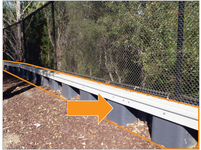
Rocksprings Temporary Floodwall

The 2017 flood event impacted nine miles of Coyote Creek beyond just the Rock Springs neighborhood. The scope of the problem for the entire stretch of creek and its surrounding areas first needs to be thoroughly analyzed and understood. Also, it takes time to secure the funding for this significant public works project, which is currently estimated at over $80 million. And Valley Water has strived to engage and coordinate with several stakeholders. Valley Water has held many meetings with the public and other government entities, such as the City of San Jose, environmental regulatory agencies, utilities, as we work together to develop the most optimum solution to the flooding problem. Please see the project website for all the work that has been done to date to get to the design phase of the project.