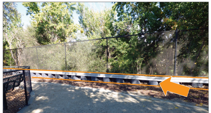
Rocksprings Temporary Floodwall

The remaining 60% of the original CCFPP will be completed in its original schedule and coincide with completing the Anderson Dam Seismic Retrofit Project's diversion tunnel. These measures are still referred to as the CCFPP. The CCFPP includes Reaches 4 and 8 and the remaining elements of Reaches 6 and 7 of the CCFPP. For more information on the extent of the CCFPP please see the following link https://fta.valleywater.org/w/dl/rqE3DHszck/? .