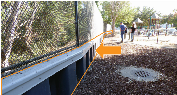
Rocksprings Temporary Floodwall