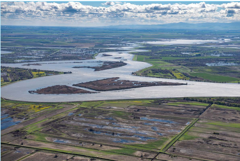
Aerial view looking east along San Joaquin River in the foreground is Mandeville Tip County Park, part of the Sacramento-San Joaquin River Delta in San Joaquin County, California.

SACRAMENTO, Calif. – Today, the California Department of Fish and Wildlife (CDFW) issued an Incidental Take Permit (ITP) to the Department of Water Resources (DWR) for long-term operations of the State Water Project (SWP). The permit covers four species protected under the California Endangered Species Act: Delta smelt, longfin smelt, winter-run Chinook salmon and spring-run Chinook salmon.